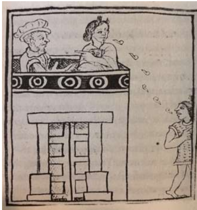
Figure 4: Malintzin translating between Cortés and a Mexican pilli (noble). Folio 29 in Book XII of the Florentine Codex.

Cortés relied on Malintzin to give to Moteucçoma's noble class, which is depicted by the finger-pointing signifying the power and authority of "he who speaks". This frank exchange was essential for Cortés because without Malintzin's knowledge of the lordly register communication with the Tenochca piles (nobility) would not have been possible.