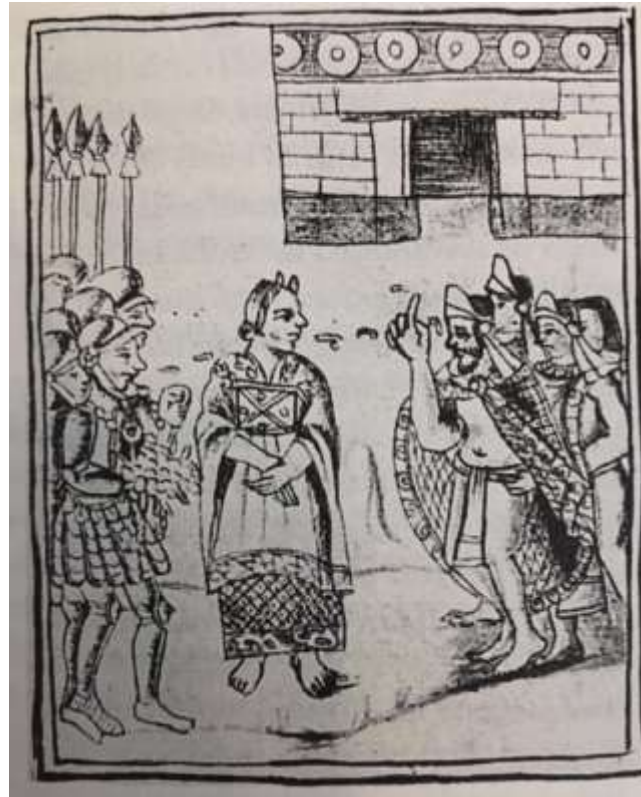
Figure 1: Malintzin translating between Spanish and Moteuczoma. Folio 26 in Book XII of the Florentine Codex .

the Nahuatl text in Book XII, Chapter Eighteen of the Codex , Malintzin can be observed using the language of Castile (Spanish). 8